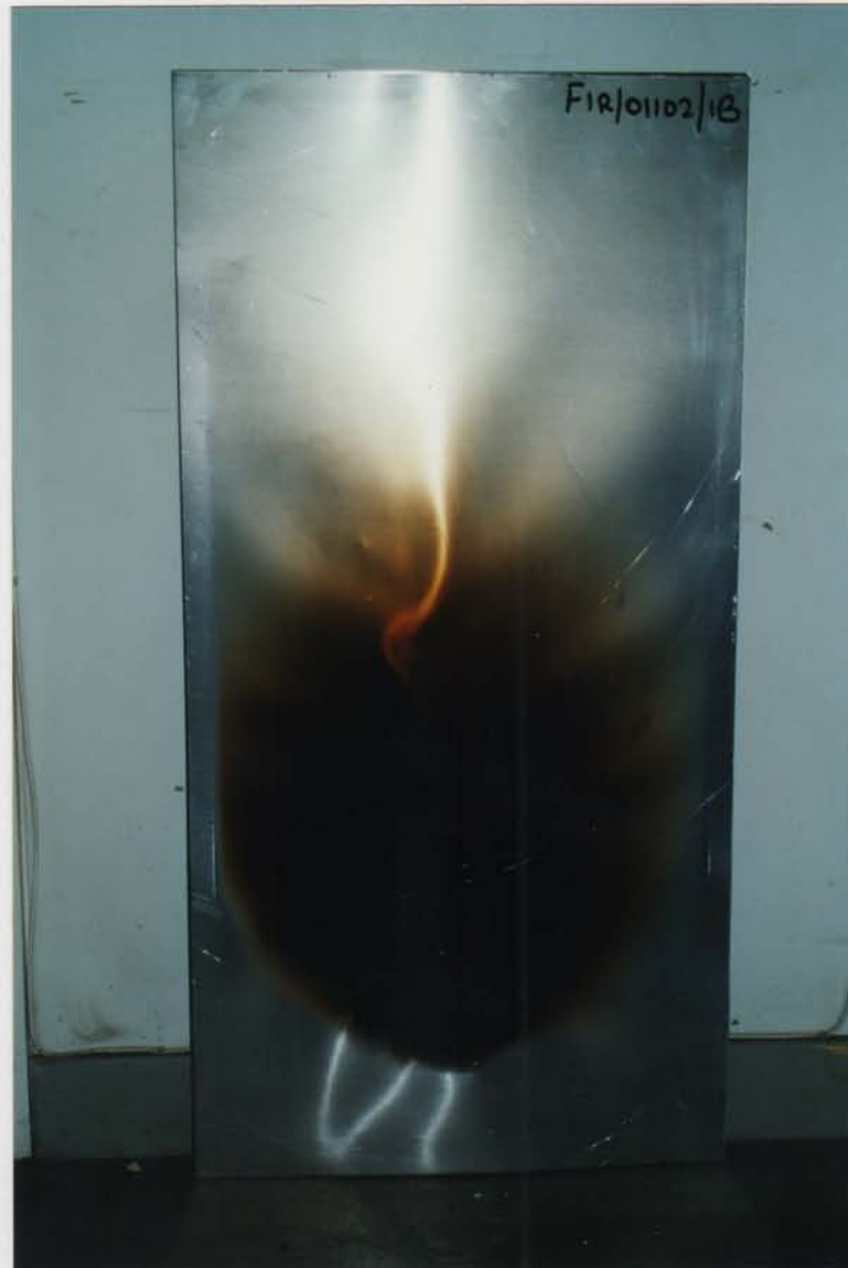
Figure 4: Sample FIR/01102/1B after test, front face.