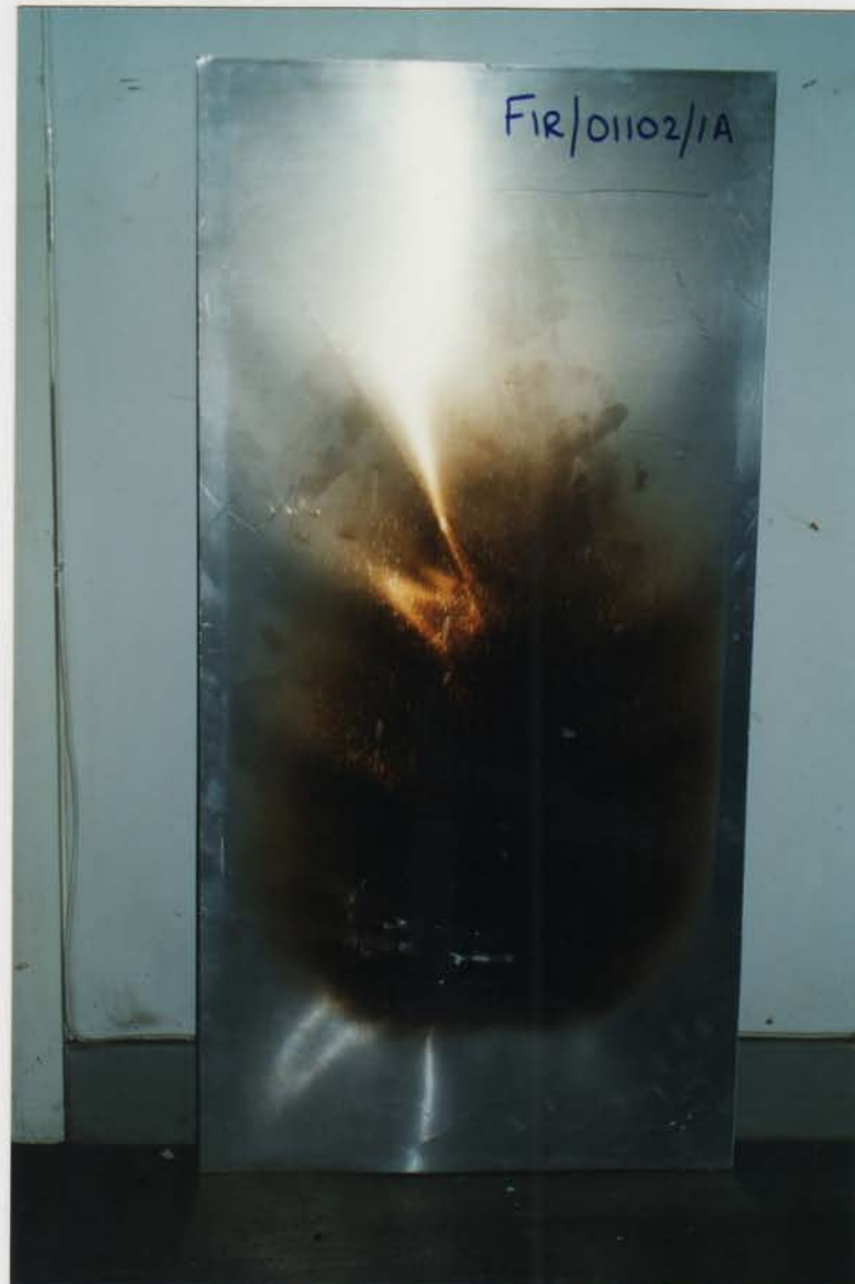
Figure 3: Sample FIR/01102/1A after test, front face.